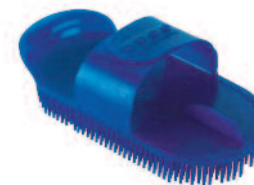
plastic curry comb