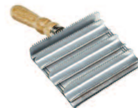
metal curry comb